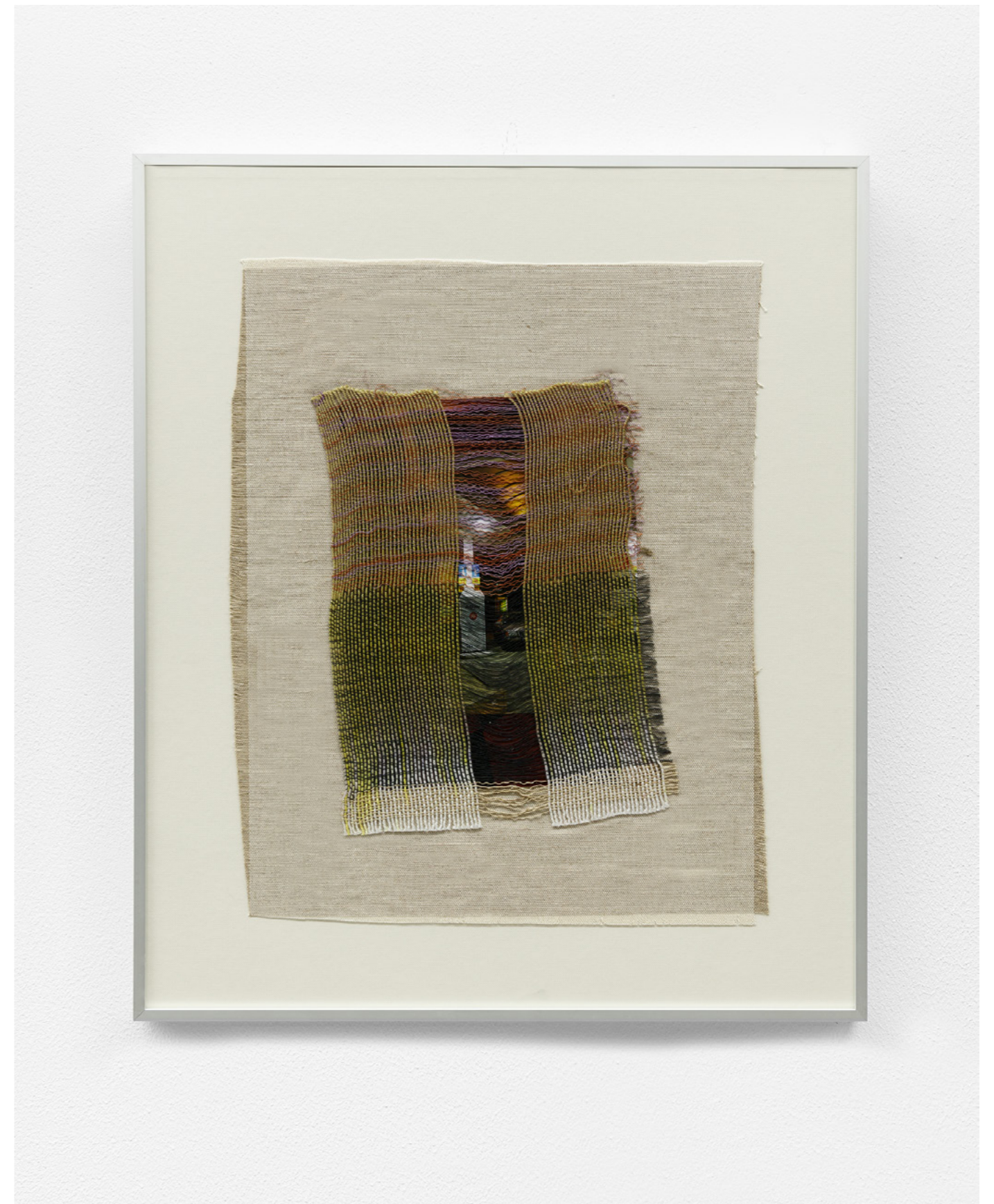
Systems of Information VIII (from the series Systems of Information ), 2023 Mixed media collage with old newspaper adverts and embroidery onto linen, Screen printed gauze cotton fabric, Aluminium framed 50x42 cm 1 400 Euros | Sold