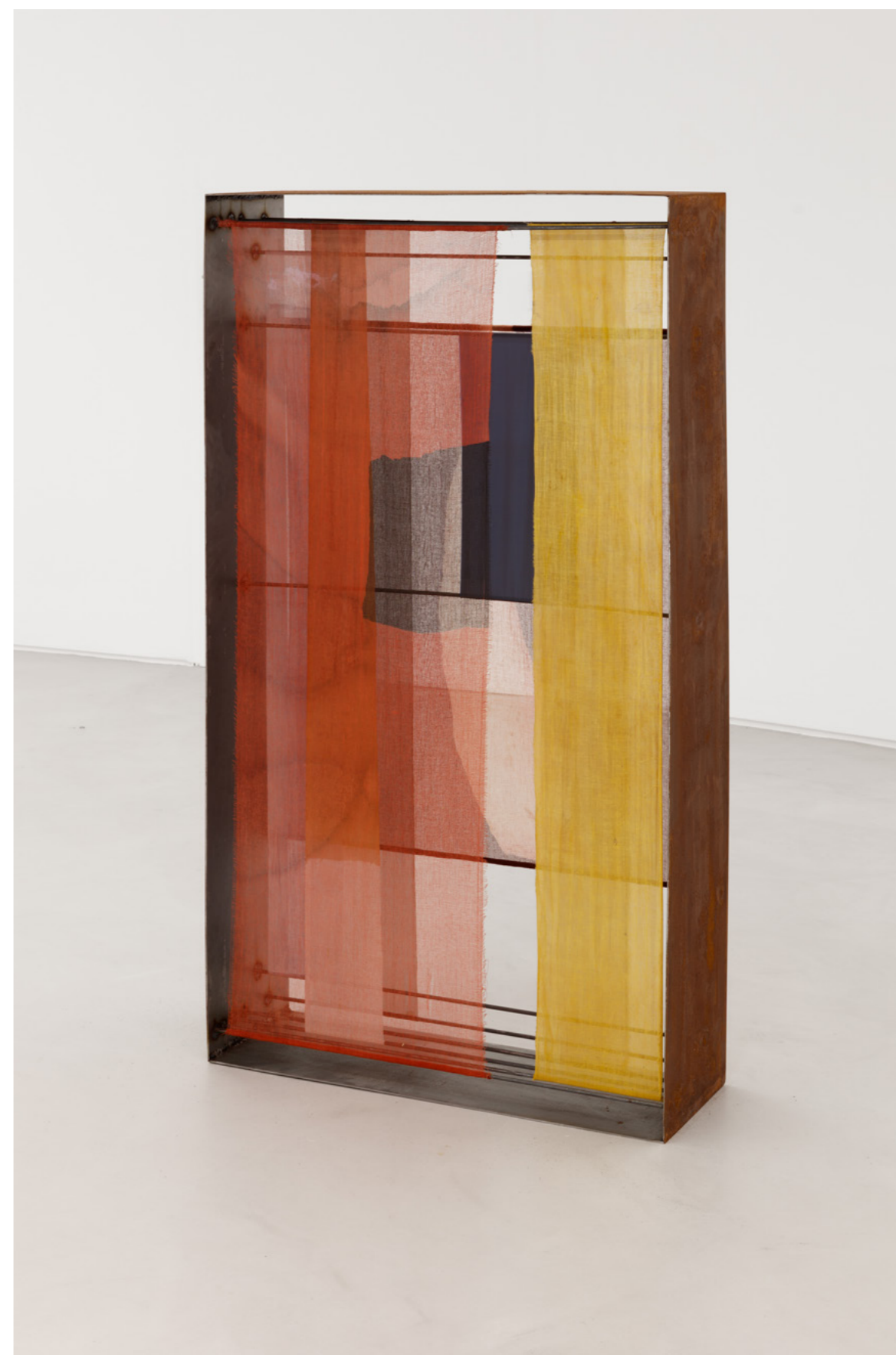
Glimpse on a box III , 2021 Silk and cotton an polyester dyed and printed, welded metal 130x70x23 cm 5 500 Euros | Sold