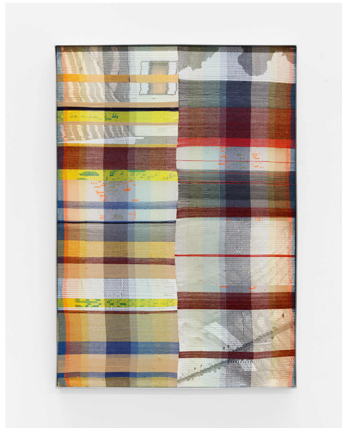
Coding III , 2021/2023 Printed photograph in paper and plastic bags trimmed and woven in the loom with cotton, wool and linen threads, Wood and Metal frame 140x98x06 cm 5 000 Euros