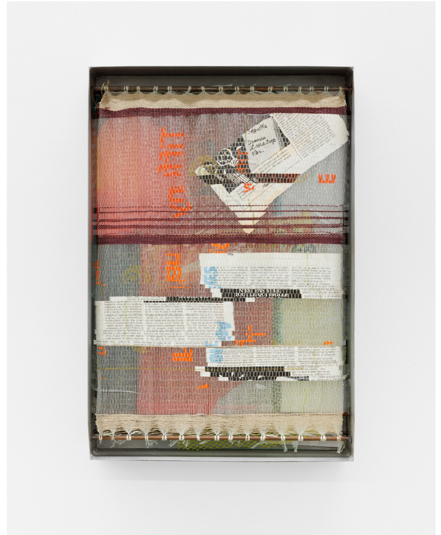
Tout L'Amerique (from the series Please see the table below ), 2023 Mixed media collage and embroidery onto polyester and reflective fabric, Old newspaper adverts and plastic bag cut and woven in cotton and linen threads, Metal box and rods welded 60x40x10 cm 3 000 Euros | Sold