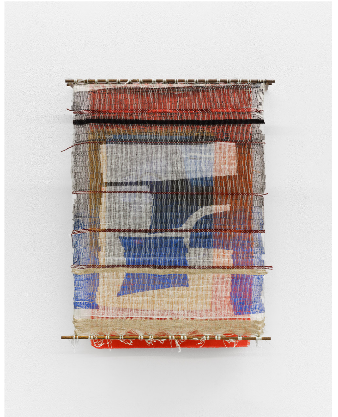
Landscape of the grey region, 2023 Screen printed gauze cotton fabric cut and woven in cotton, wool and linen threads, Old newspaper adverts collage in cotton fabric, Metal rods 52x41x08 cm 2 500 Euros | Sold