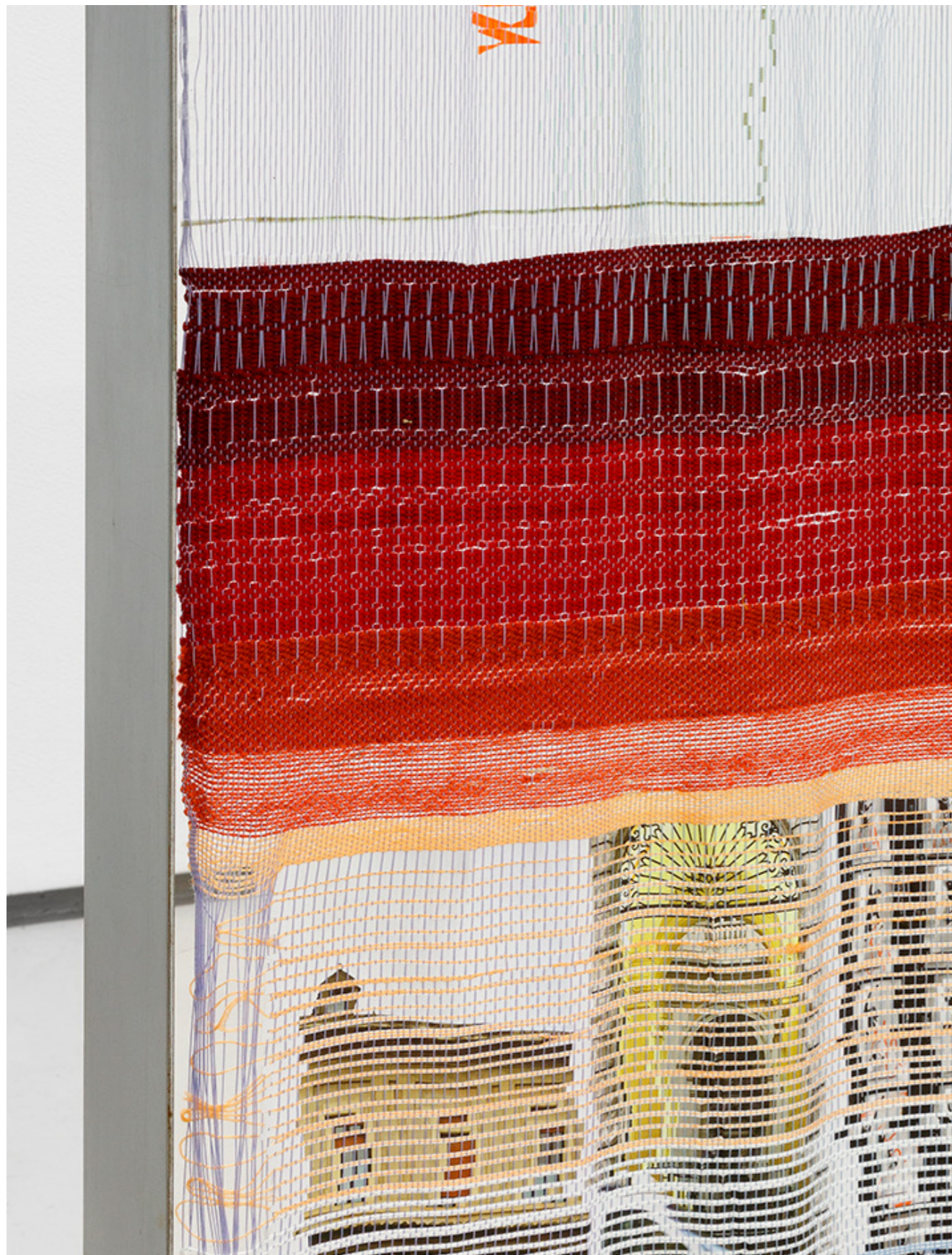
Detail of The sky is not one color I , 2021/2023 Printed photograph in paper and plastic bag trimmed and woven in the loom with cotton and linen threads, Metal frame and welded rods 107x53x11 cm 4 000 Euros | Sold