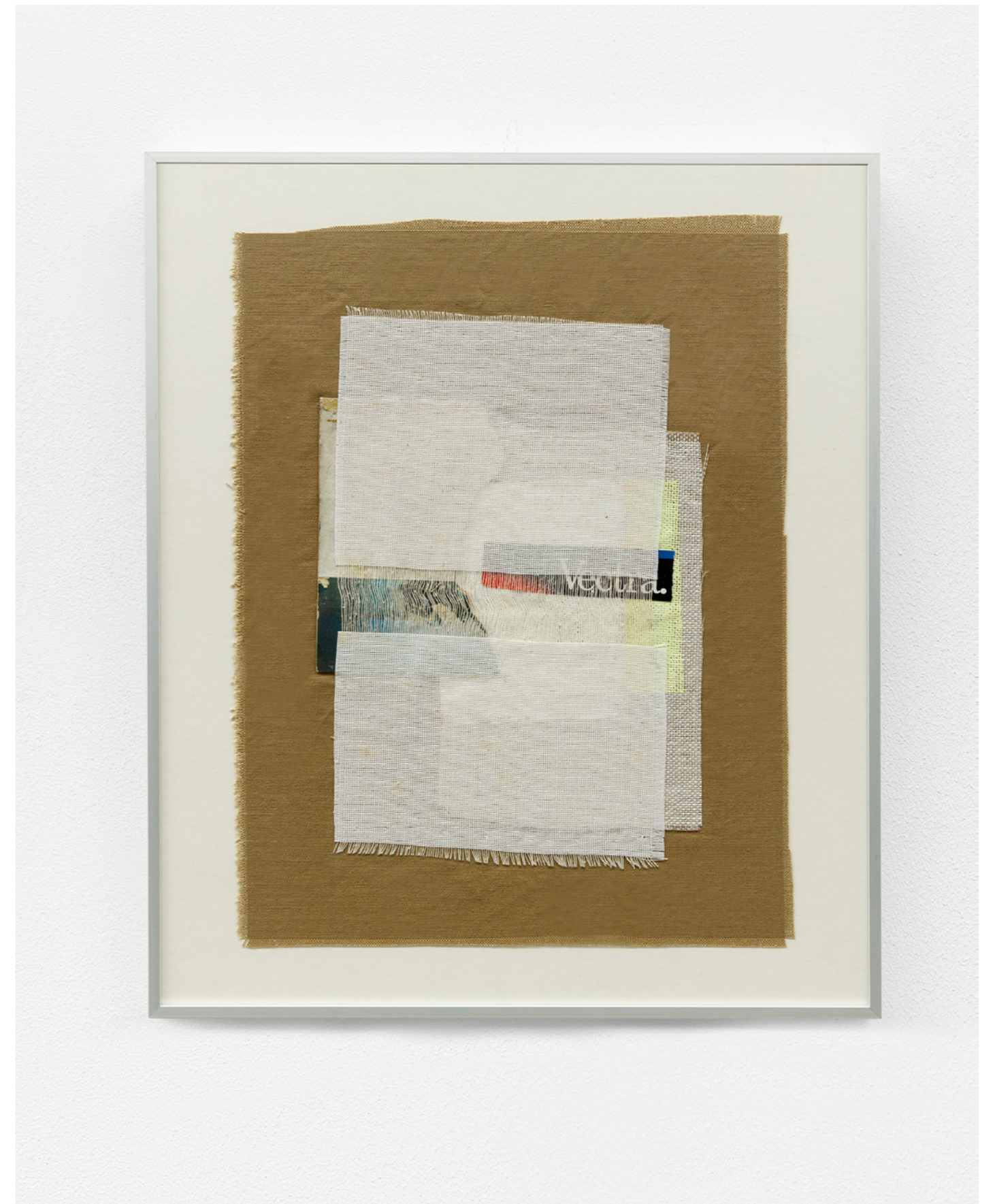
Systems of Information VI (from the series Systems of Information ), 2023 Mixed media collage with old newspaper adverts and embroidery onto linen, Screen printed gauze cotton fabric, Aluminium framed 50x42 cm 1 400 Euros | Sold