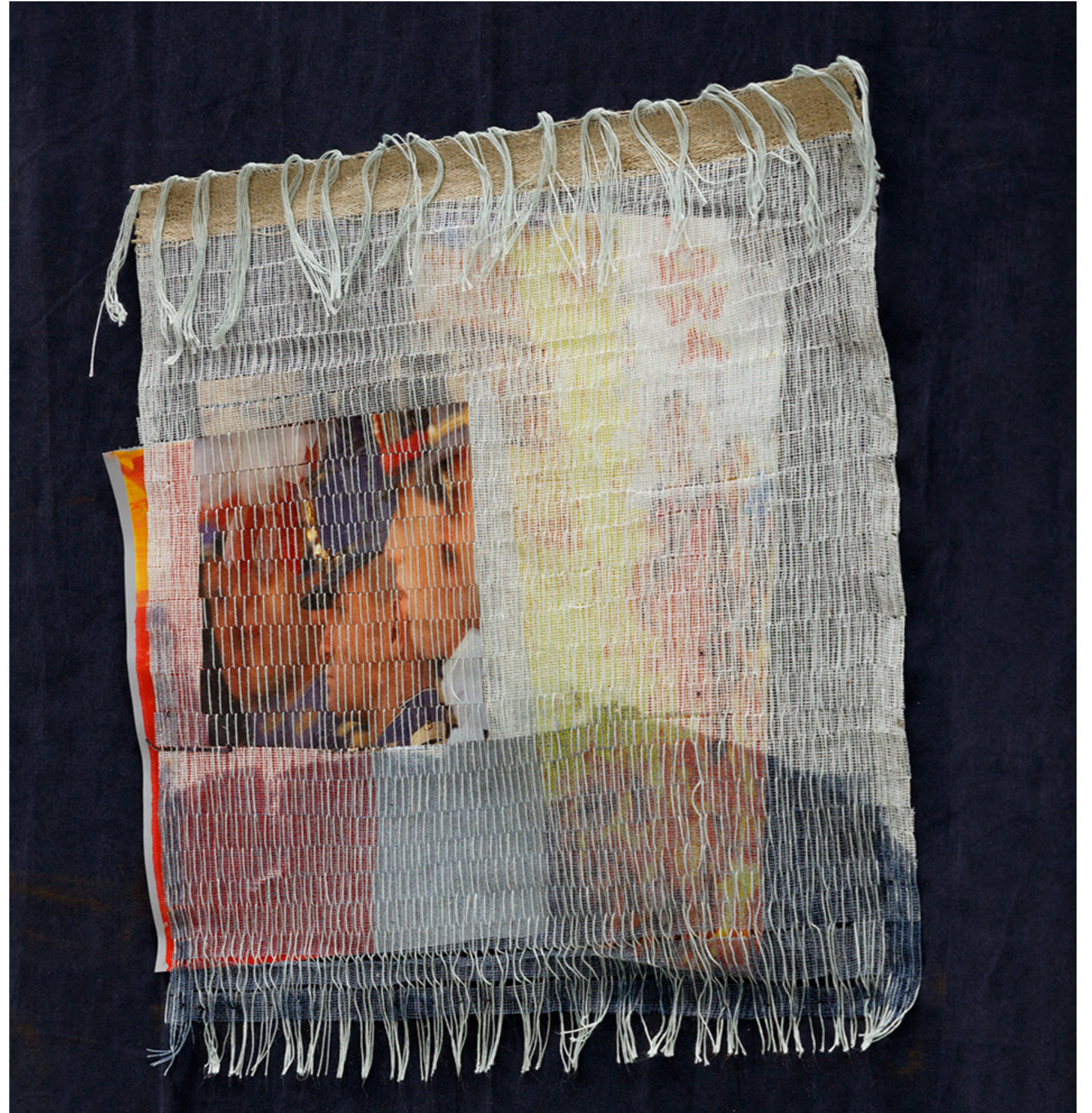
Detail of Reactive poem flag , 2023 Paint brushed gauze cotton fabric cut and woven in cotton and linen threads, Old newspaper adverts and screen printed reflective fabric collage on cotton fabric, Metal rods 59x75x08 cm 2 500 Euros | Sold