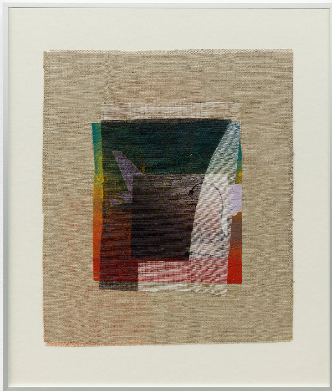
Systems of Information V (from the series Systems of Information ), 2023 Mixed media collage with old newspaper adverts and embroidery onto linen, Screen printed gauze cotton fabric, Aluminium framed 50x42 cm 1 400 Euros | Sold