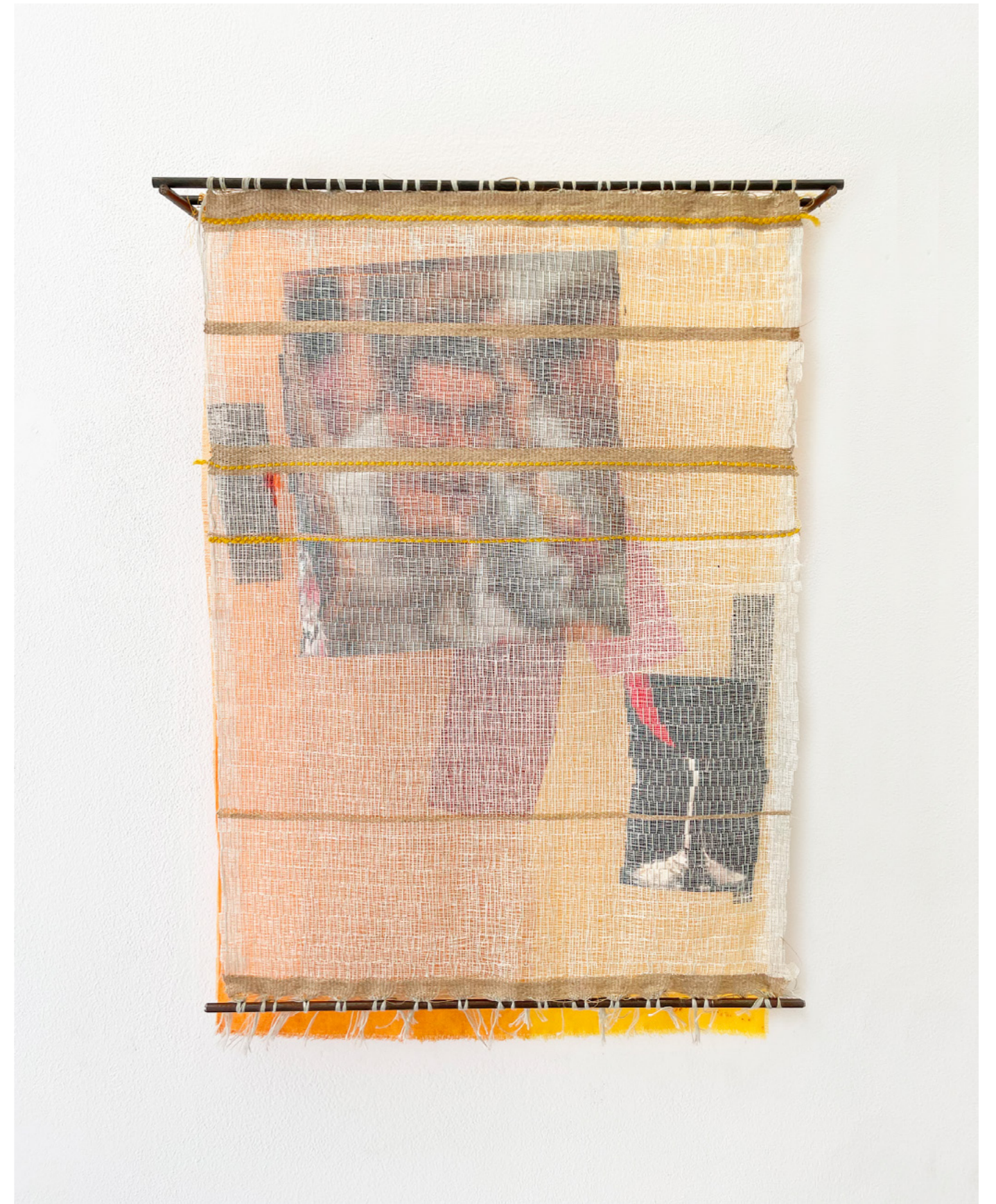
I lost my memory, my thought got blurred II, 2022 Old newspaper adverts in gauze cotton fabric cut and woven in cotton and linen threads, Screen printing and dyed in cotton fabric, Metal rods 60x44x08 cm 2 500 Euros | Sold