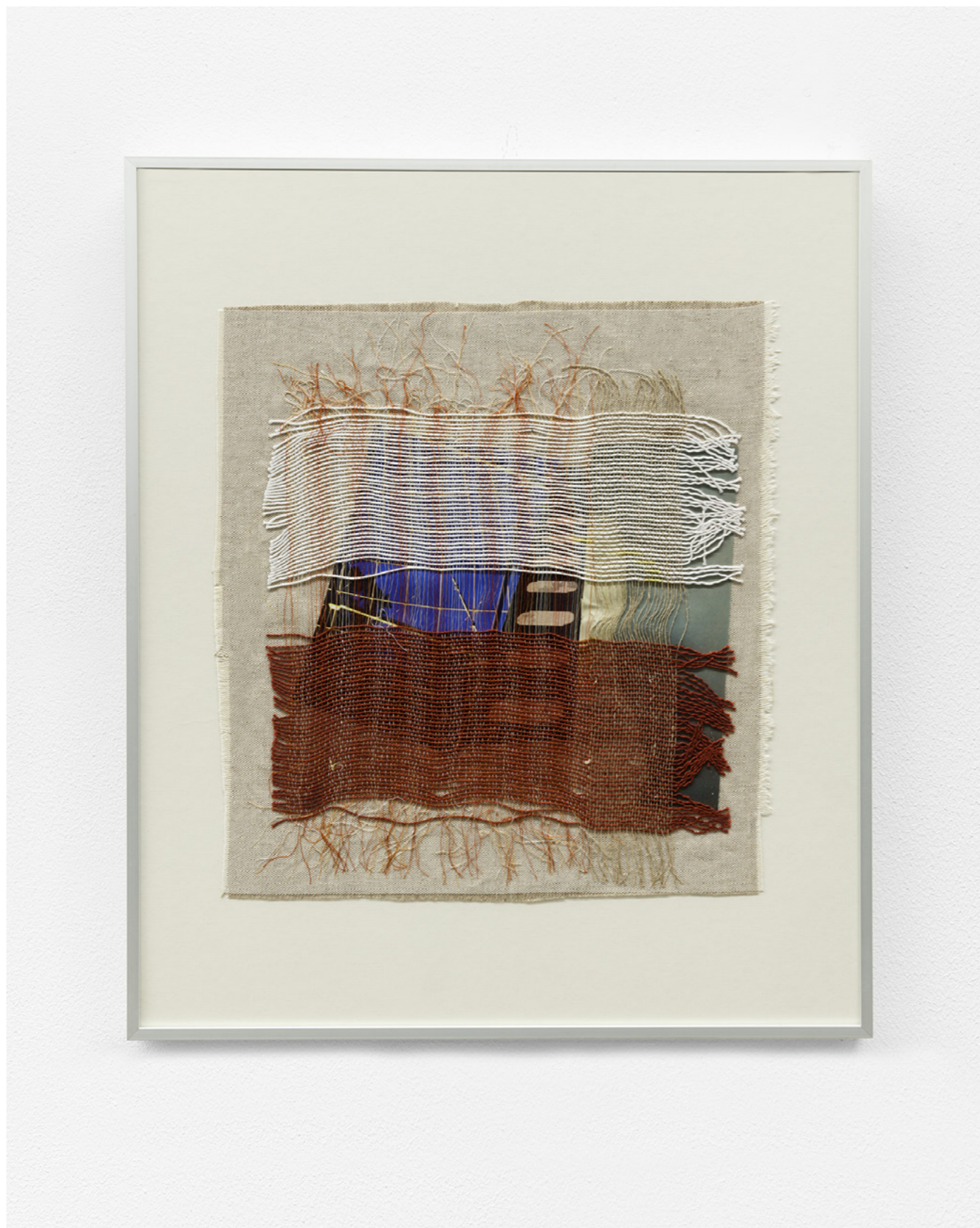
Systems of Information VII (from the series Systems of Information ), 2023 Mixed media collage with old newspaper adverts and embroidery onto linen, Screen printed gauze cotton fabric, Aluminium framed 50x42 cm 1 400 Euros | Sold