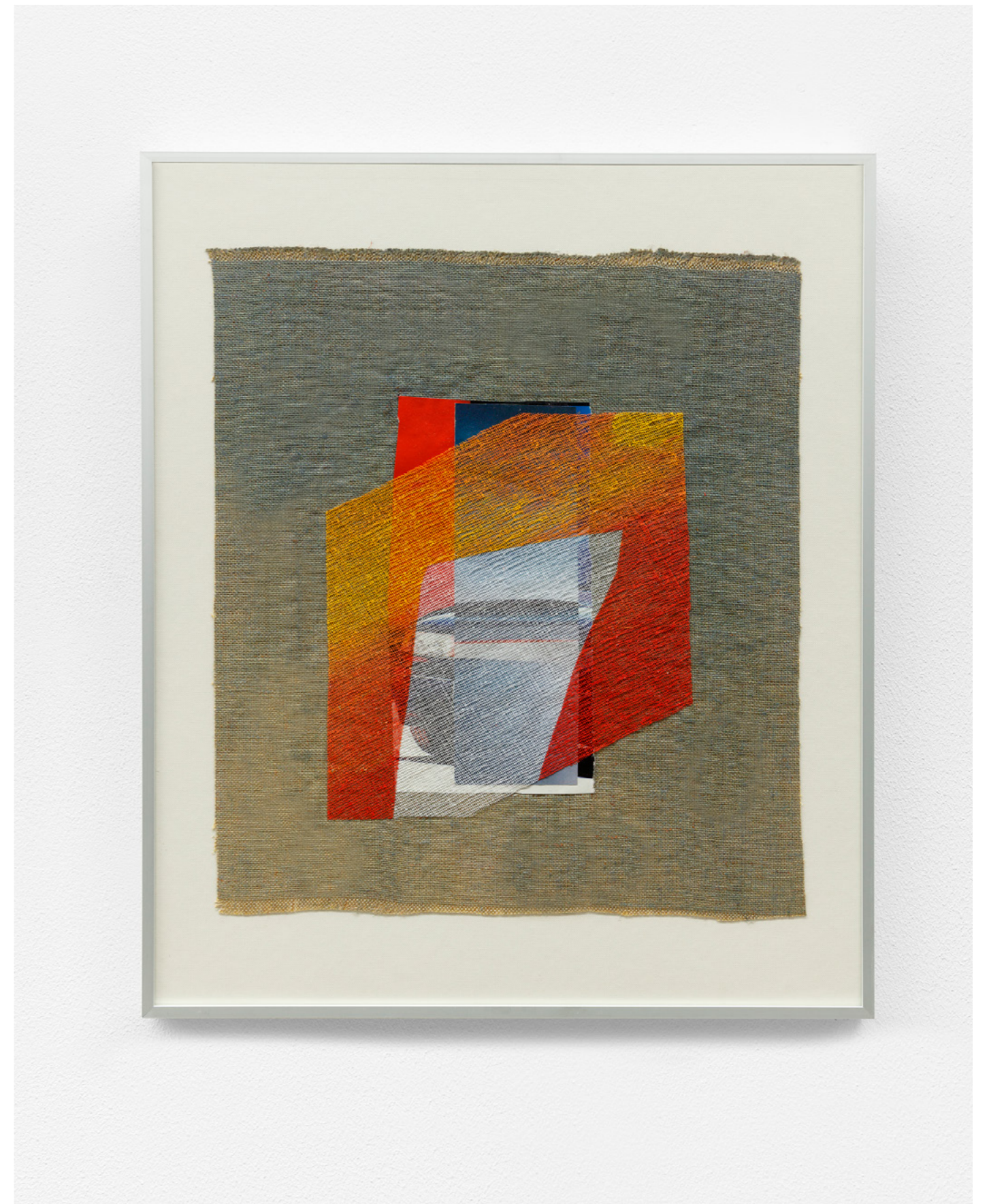
Systems of Information II (from the series Systems of Information ), 2023 Mixed media collage with old newspaper adverts and embroidery onto linen, Screen printed gauze cotton fabric, Aluminium framed 50x42 cm 1 400 Euros | Sold