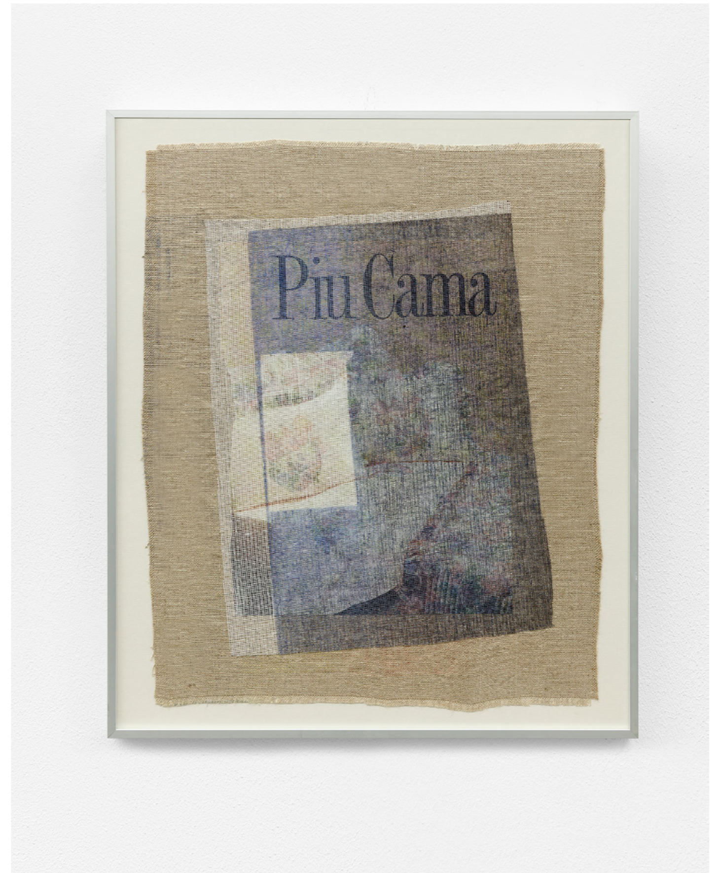
Systems of Information IV (from the series Systems of Information ), 2023 Mixed media collage with old newspaper adverts and embroidery onto linen, Screen printed gauze cotton fabric, Aluminium framed 50x42 cm 1 400 Euros | Sold