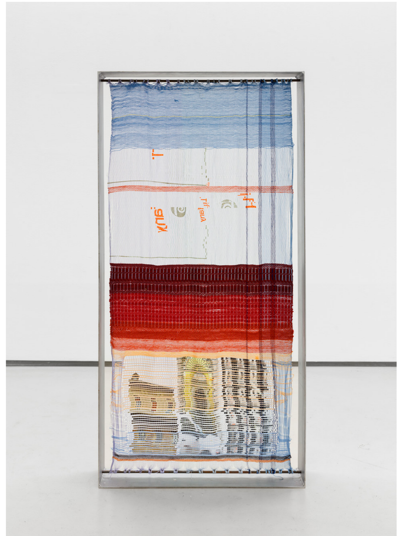
The sky is not one color I , 2021/2023 Printed photograph in paper and plastic bag trimmed and woven in the loom with cotton and linen threads, Metal frame and welded rods 107x53x11 cm 4 000 Euros | Sold