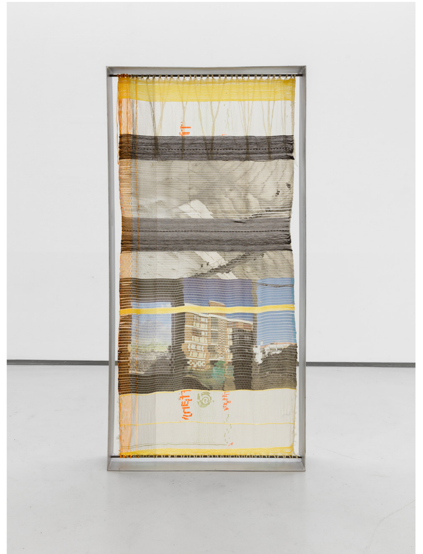
I lost my heart in Olympia Stadium, 2021/2023 Printed photograph in paper and plastic bag trimmed and woven in the loom with cotton and linen threads, Metal frame and welded rods 118x58x11 cm 4 200 Euros | Sold