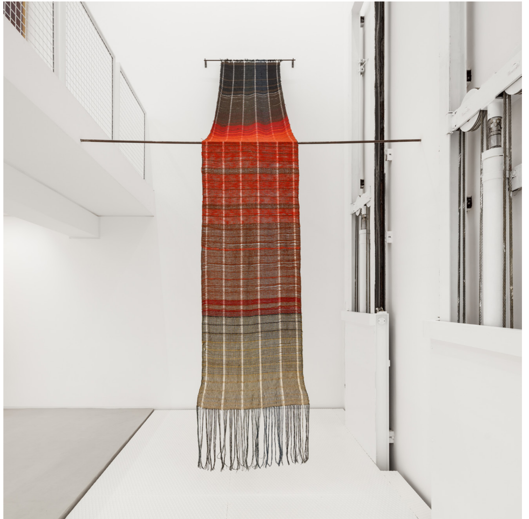
Awning at night, Seville, 2021 Wool, cotton, viscose and linen threads dyed and woven Variable Dimensions 5 500 Euros