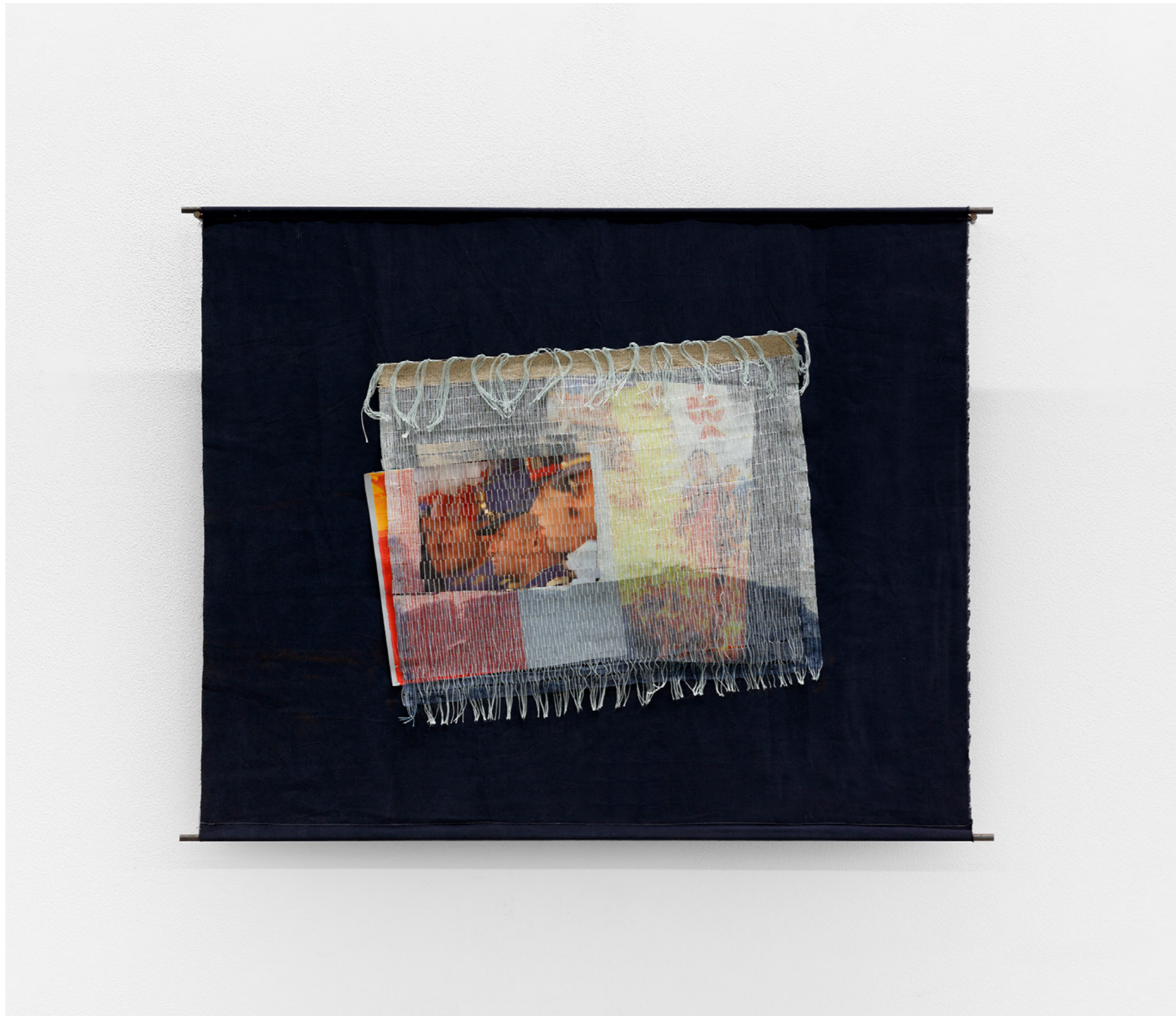
Reactive poem flag, 2023 Paint brushed gauze cotton fabric cut and woven in cotton and linen threads, Old newspaper adverts and screen printed reflective fabric collage on cotton fabric, Metal rods 59x75x08 cm 2 500 Euros | Sold