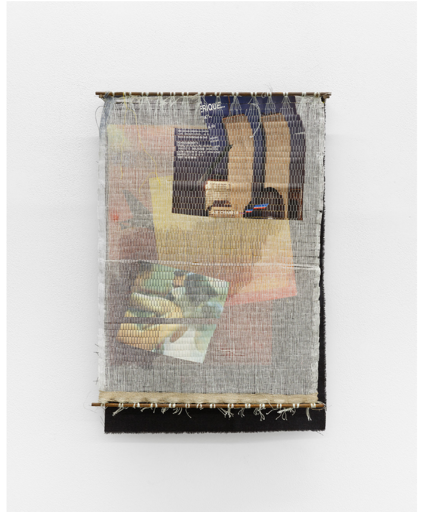
Reconstruction of loss, 2023 Old newspaper adverts in gauze cotton fabric cut and woven in cotton and linen threads, Screen printing and collage in wool fabric, Metal rods 59x41x08 cm 2 500 Euros | Sold