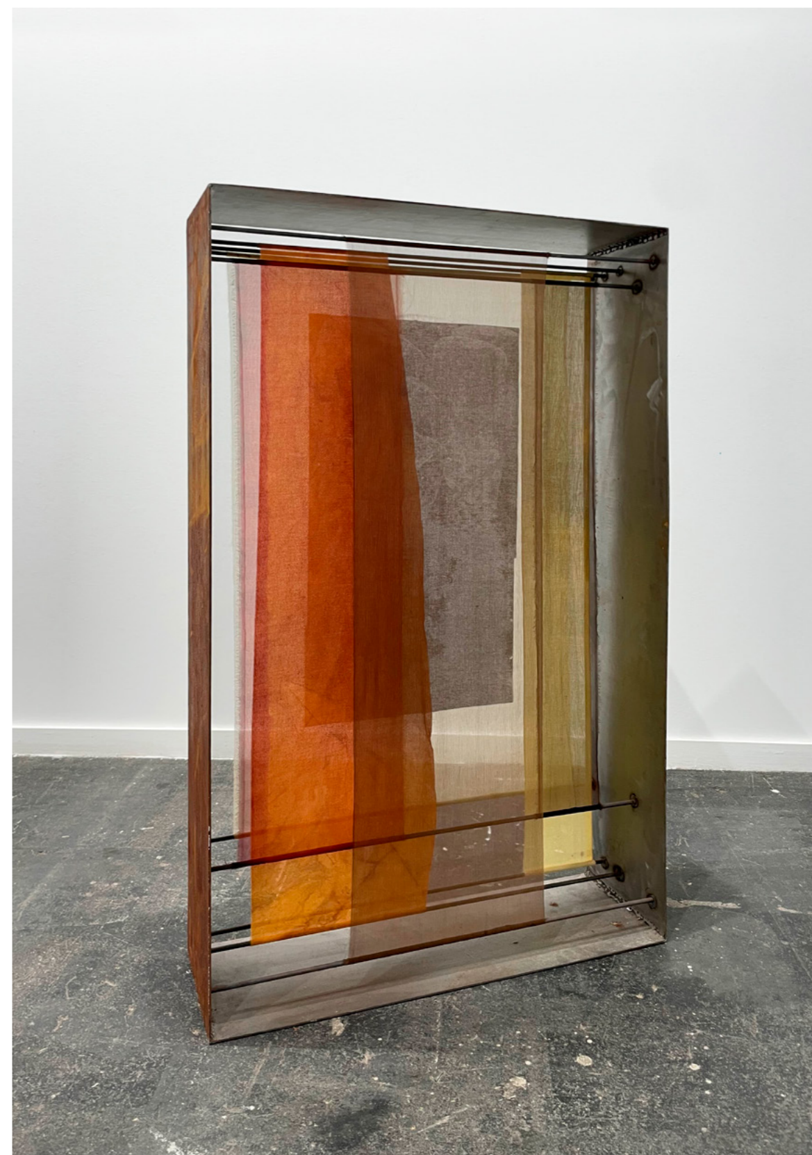
Glimpse on a box IV , 2021 Silk and cotton an polyester dyed and printed, welded metal 100x60x20 cm 3 500 Euros | Sold